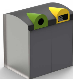
Baco Selective sorting hatch