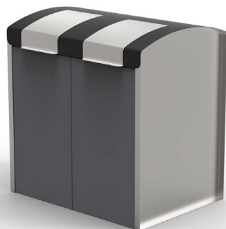
Baco Garbage hatch