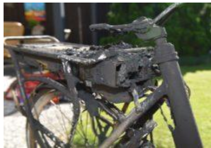
Damage after fire

A bicycle battery fire is unpredictable. If, for example, a battery is damaged or contains a manufacturing defect, this is not visible on the outside. When a decomposition reaction of the chemicals in the battery starts, is not predictable.